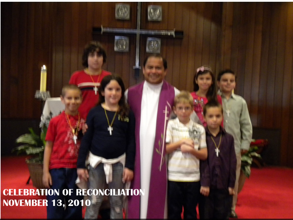
CELEBRATION OF RECONCILIATION NOVEMBER 13, 2010

THANK YOU TO MINISTRY HEADS FOR PARTICIPATION IN MINISTRY HEADS MEETING Nov. 15th & FOR ALL OF THE WORK THAT YOU DO TO BE ALIVE IN CHRIST.