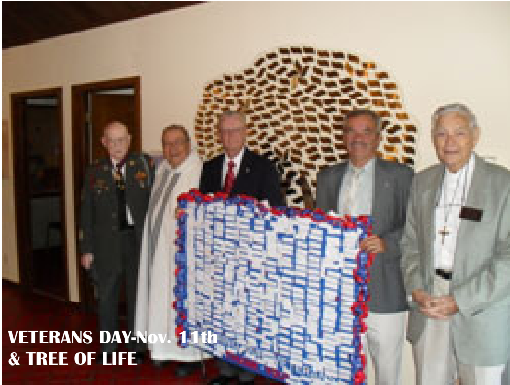
VETERANS DAY-Nov. 11th & TREE OF LIFE

SACRAMENTS Baptisms and Confirmation: Please contact the Parish Office at 245-2458 for more information. Marriage: Call the office at least 6 months prior to intended date. Anointing of the Sick: Available at end of all weekend Masses. Vocations: Call the office for more information and guidance. Confessions: 3:00-3:45 p.m. on Saturday or contact the office for appointment. Hospital and Homebound Communion: Call Parish Office. Friday Eucharistic Adoration: Holy Hour 3-4 p.m.; Silent 4-6 p.m. SICK CALL and FUNERAL ARRANGEMENTS 245-2458